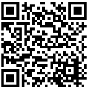
SCAN QR FOR PRODUCT PAGE

This part number has created a premium 1 metre SC SM white pigtail.