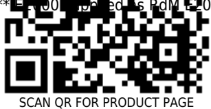
SCAN QR FOR PRODUCT PAGE

• Information in this document is correct as of September 16, 2019