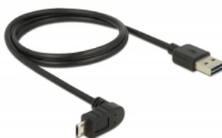
EASY-USB Micro B