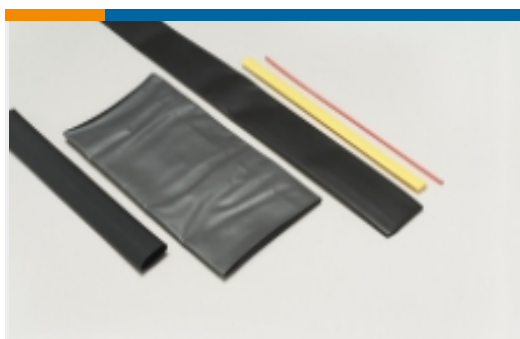
Heat Shrink Tubing(338)