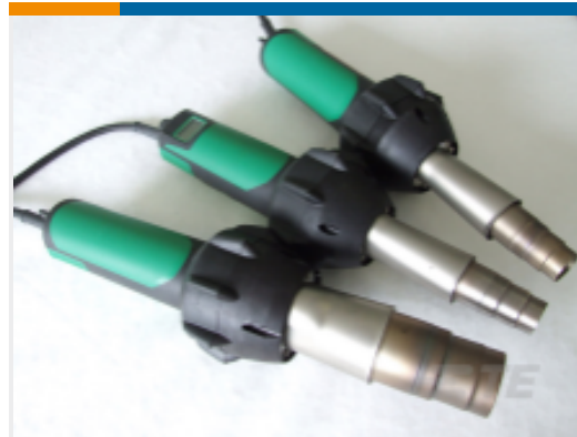
TE Part # EG1114-000 CV1981-ST-230V1600W-EU