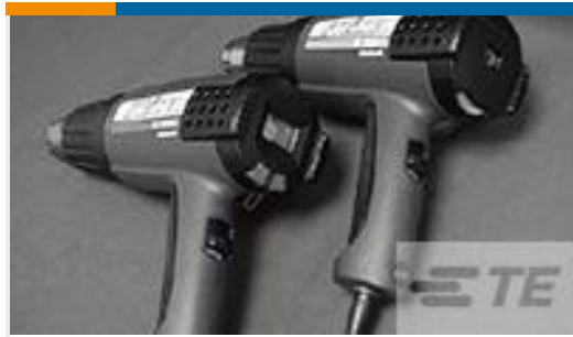
TE Part # CJ2087-000 HL2010E-KIT-120V