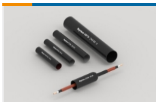
Power Cable Tubing & Accessories(93)