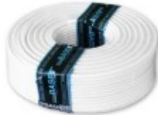
CABLE PACKING- 100m