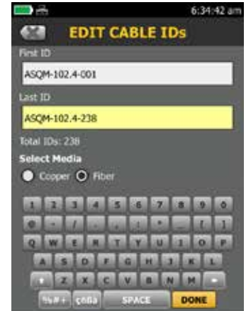
A full keyboard for faster data entry than the DTX

Investing in Versiv means you'll also be ready to take on new jobs. Versiv supports future measurements such as TCL and resistance unbalance that your DTX never will. Certify coax and standard or industrial Ethernet patch cords in both directions. Test singlemode fibers that are more than ten times as long. And the modular design means you can add new capabilities without buying a new tester.